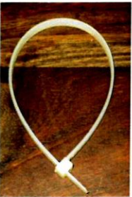
Straps 2 Pieces