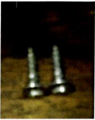
Small screws 4 Pieces